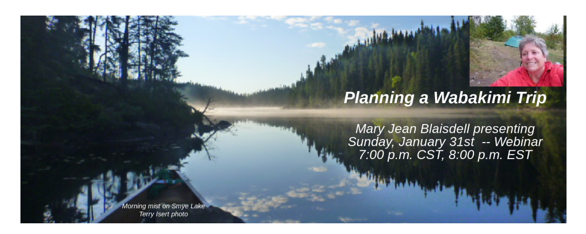
"Planning a Wabakimi Trip" Sunday, Jan 31, 2021 7:00 PM CST, 8:00 PM EST Join Zoom Meeting Here!

Wabakimi is a wilderness land of opportunity for paddling adventures. But it may be a little more "into the wild" than you've planned before. Planning a trip into Wabakimi Provincial Park could be overwhelming but with great information and resources and the gear needed, you can enjoy the wilderness trip of a lifetime! "MJ" will provide you with a starting point for designing your trip!