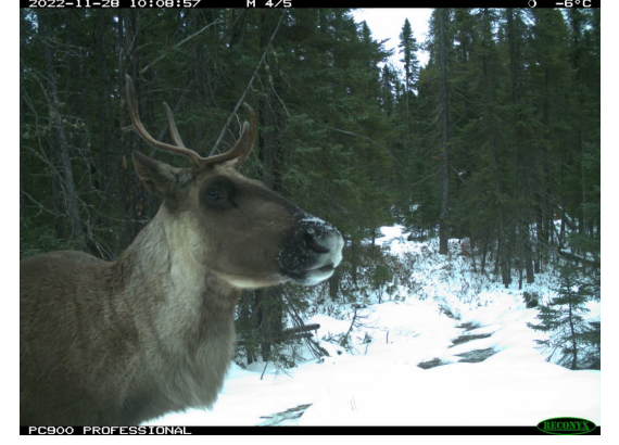
Boreal Caribou (Rangifer tarandus caribou)

It is rare to see this solitary creatures. You might think they look like a relative of the bear, but they are a part of the weasel family, Mustelidae. They are the largest of the family, to the surprise of no one. They are impeccably designed for northern climates, with large padded paws to keep warm and aid with travelling through snow, and strong skulls that allow it to crush bones and frozen carcasses. Males weigh 13 to 18 kg, whereas females weigh 7.5 to 12.5 kg. As they require large habitat ranges and are sensitive to disturbances, their presence is considered an indicator of a healthy ecosystem. Wolverines are currently listed as "Special Concern" under the federal Species at Risk Act.